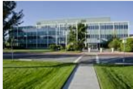
Idaho Transportation Department Headquarters Building Boise, Idaho